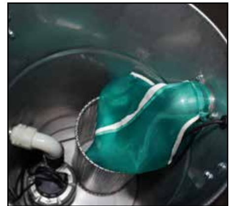
The polypropylene wet filter prevents from foaming and from absorption of solid particles.