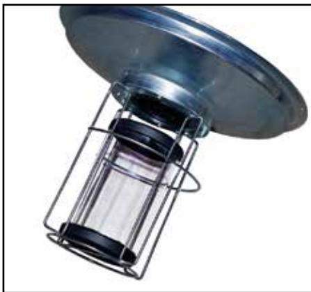
Float of the suction unit