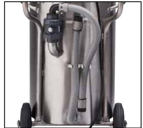
Controlled emptying through drain hose