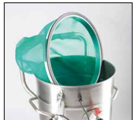
The special wet filter prevents from foaming and from the absorption of solids