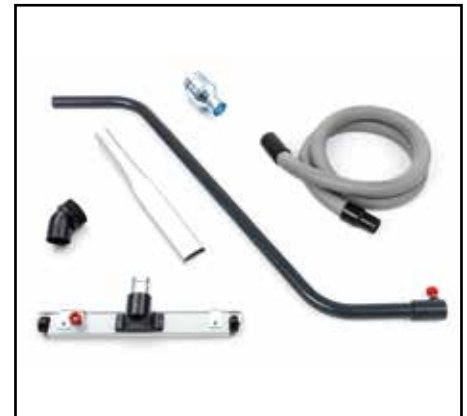
Accessory kit for IWV 80 pump available separately