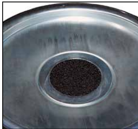
The suction unit is additionally protected by a special sponge filter.