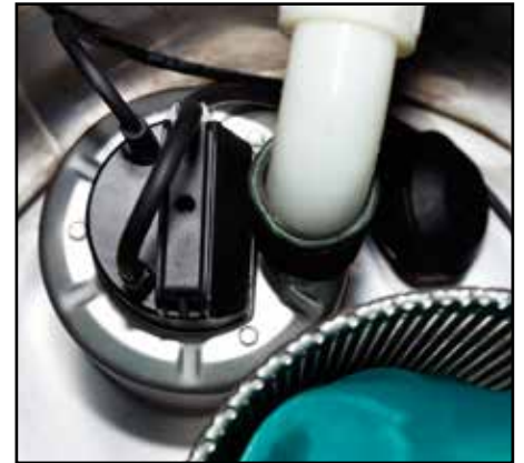
Submersible pump and float