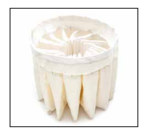
Large star filter made of washable polyester