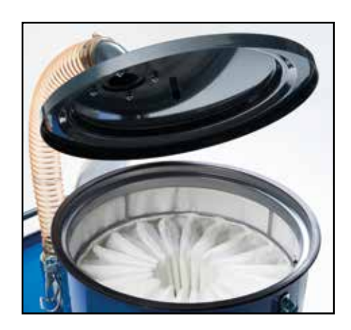
Filter cartridge with 30,000 cm<sup>2</sup> filter surface area