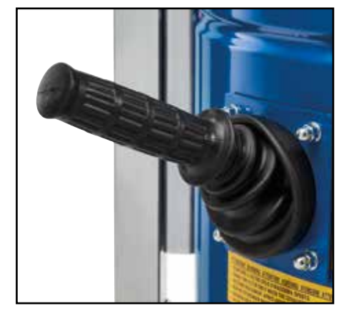
Manual filter shaking to keep suction performance high