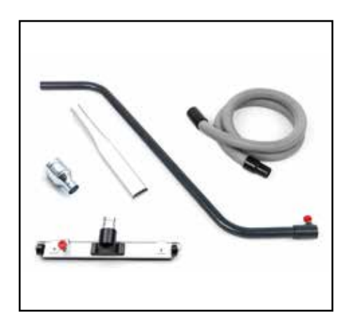
Comprehensive accessories kit for IDV 100