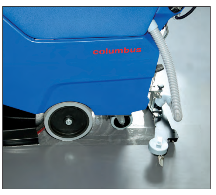
Powerful suction: streak-free floors which can be walked on immediately.